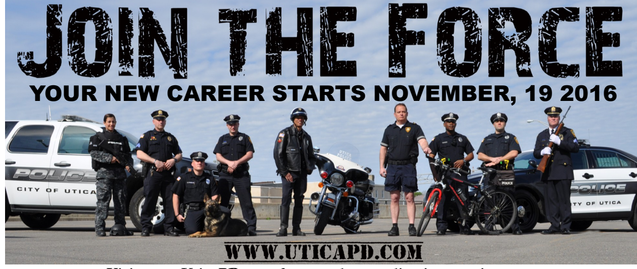
Visit www.UticaPD.com for complete application requirements.

A Police Officer is responsible for the enforcement of laws, ordinances and protection of lives and property in an assigned area during a specific period. These duties consist primarily of routine patrol tasks, assisting in investigation of criminal offenses and the apprehension of criminals. Ordinarily a police officer, whether on patrol work or on special assignment works under the supervision or direction of a higher ranking officer. However, there is considerable independent responsibility for exercise of sound judgment in emergencies. Does related work as required.