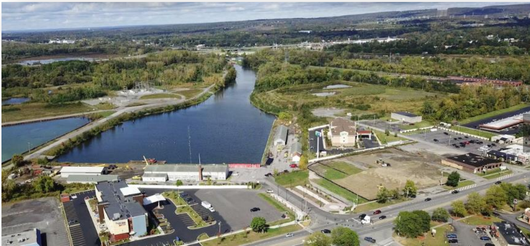
Utica's Harbor Point, 2018

At the close of the 2019 construction season, the site will have a dedicated two-lane access off Wurz Avenue West including a roundabout as indicated on page 9, with a secondary access off Wells Ave. The site will also have a gravel perimeter road. Utilities consisting of an 8-inch water main and 8-inch sanitary sewer main will be installed to the roundabout with gas and telecommunication service connections available nearby. A pond will be constructed adjacent and just north of the roundabout for stormwater mitigation measures.