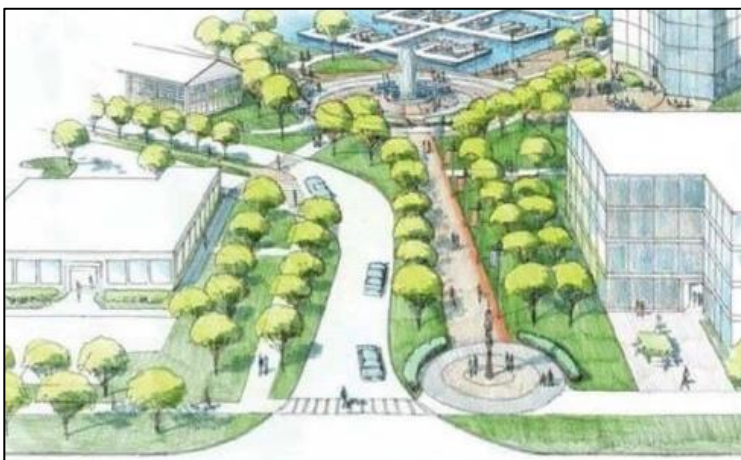
Gateway Concept for Utica Harbor Point. The Gateway was constructed in 2017

Additional dollars are available for construction including the Wurz Avenue Extension and the closure of the dredge spoils area. When complete, the proposed ~17.6 acres development site within Harbor Point will have direct access complete with infrastructure including water, sewer, telecommunications, and stormwater.